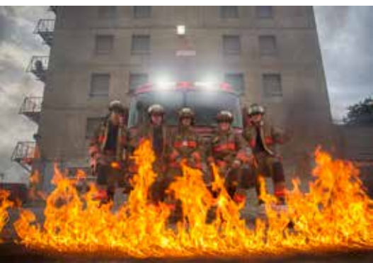
Firesound - A Band of Toronto Firefighters

Counterpoint is diversifying what it does. While our main focus will remain classical music, orchestras are looking for ways to bring in new audiences. This is where we want to expand. Many orchestras are presenting concerts which are pop or rock oriented, an extension of their current Pops Series, and are collaborating with pop and rock groups.